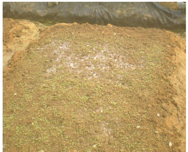
Fig. 2: Fluffy fungal threads infecting a seed bed.