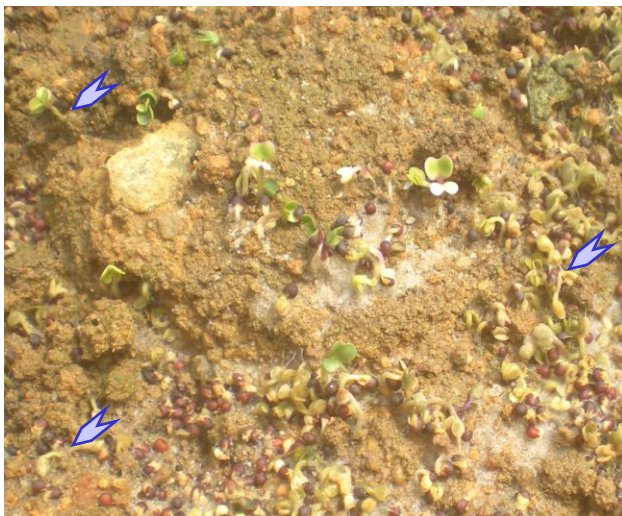
Fig. 1: Damp off seedlings with infected roots or stem at the soil line collapsed over (↔).

Damping off is due to several soil and water-borne fungi particularly the Pythium spp. , Phytophthora spp. , Rhizoctonia solani and Fusarium spp. . These can act collectively to the demise sown seeds and seedlings. Pre-emergent damping off occurs when sown seeds are attacked before or soon after seed germination, thus causing apparent seed germination failure. Damping off is termed post-emergent and occurs after the seedlings have emerged from the soil. The disease attacks the young roots, stems at the soil line or up the hypocotyls causing their stems to become thin and brown, and the seedlings to collapse over and die (Fig. 1). In severe infestations, damping off is evident with the presence of fluffy white fungal threads (Fig. 2) webbing over the collapsed seedlings and dead seeds. The disease is encouraged by cool, humid conditions, over-watering and overcrowded seedlings.