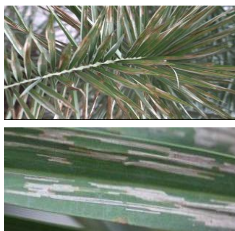
Fig. 2 : Leaf ends damage (top) and larval mines caused by Promecotheca spp. (bottom).