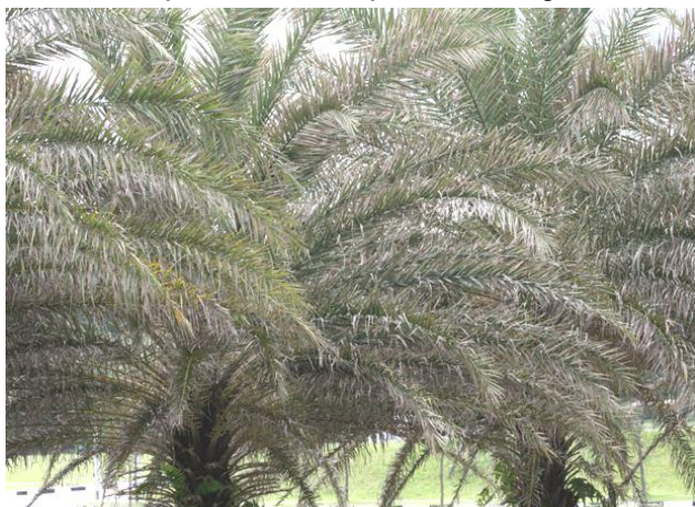
Fig. 1 : Severe leaf miner beetle damage to Phoenix palms.

Systemic insecticides e.g. abamectin, chlorpyrifos, imidacloprid or profenofos are used with parasitoids to manage the pests in monocultures. Mineral oil and neem products may offer moderate reprieve from the pests for the gardens.