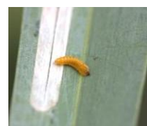
Fig. 4 : Larva extracted from a mine trail.