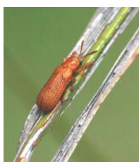
Fig. 3 : Adult Promecotheca feeding on leaf.