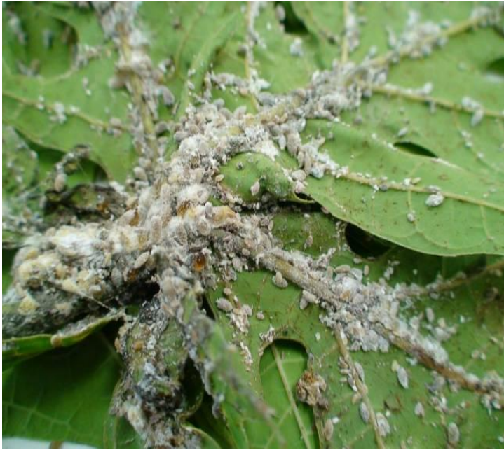
Fig.1 Heavy mealybugs infestation along the veins of papaya leaves