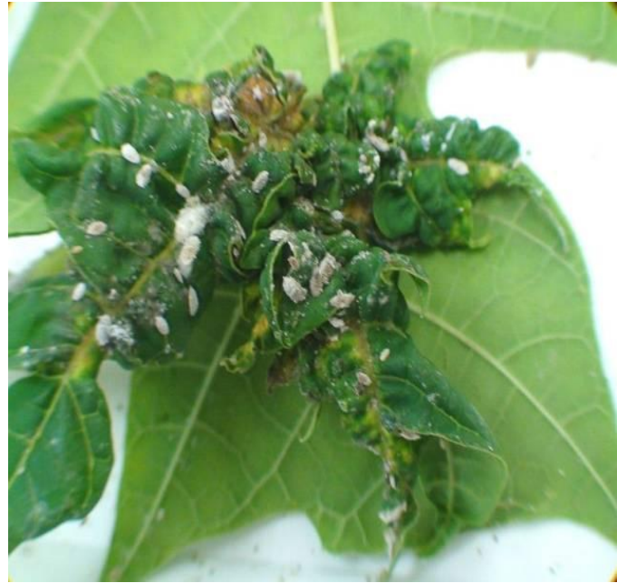
Fig. 2: Papaya leaf severely malformed from mealybug feeding.