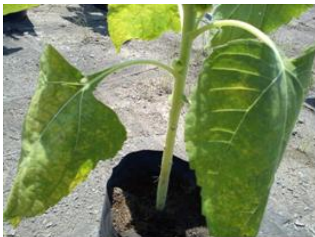
Fig. 1. Leaf chlorosis and premature leaf dropping caused by whiteflies

Barriers such as row covers, control of weeds adjacent to cultivated fields, the use of trap crops, and implementation of intercropping can be an alternative method for the reduction of pests in certain situations. Chemical control is advisable to suppress the population of SPW. Both petroleum based and plant derived oils have been found efficacious against all stages during the initial infestation. However, if SPW has built up its population on a crop, like sun flower, imidacloprid 200 SC at 0.5 ml/l, or abamectin 1.8 EC at 2 ml/l should be used.