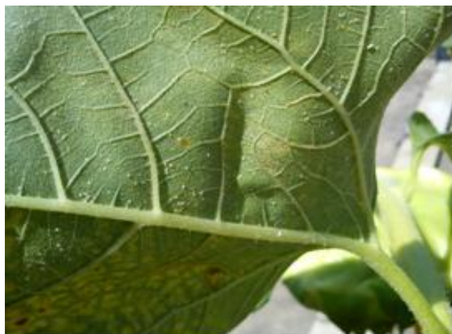
Fig. 2. Puparia and adult whiteflies