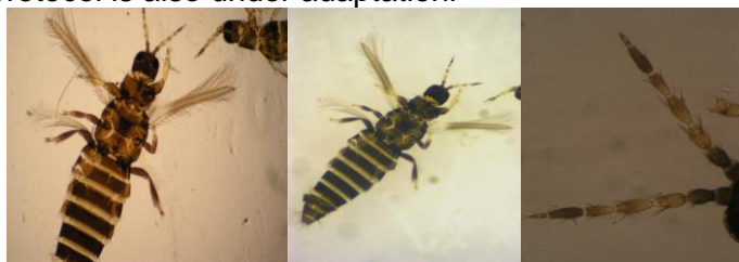
Fig 1. Frankliniella occidentalis – Close up view