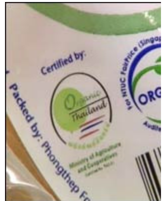
Photos 2 o Organic produce certification label

The outlet is the second FairPrice Finest store, a new retail concept started by the labour m bring quality food products at affordable prices to Singaporeans.