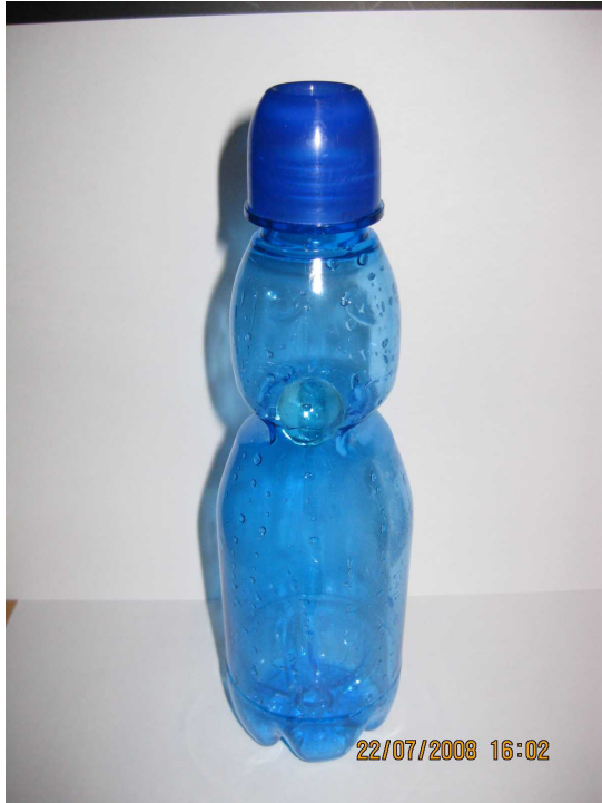
1) Overall View of glass ball/ marble soda water