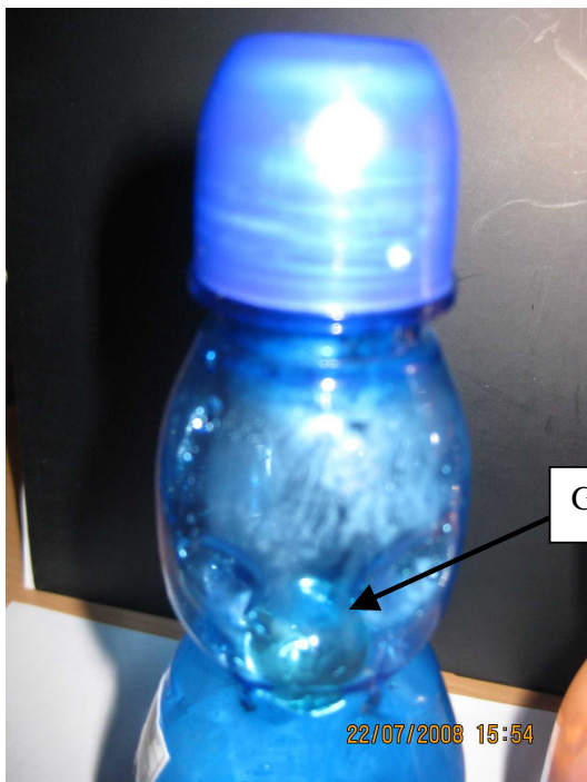
3) Close up view of glass ball/ marble